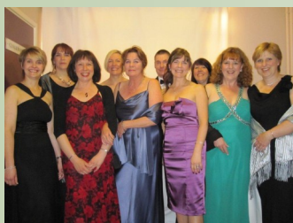
The Panther Team do scrub up well?!

We are offering you the opportunity to support your local Scout Troop while gaining permanent recognition of your support for the community and future generations to see. Our extension and refurbishments is planned with a large "Wall of Thanks". Sponsors buy a brick which is engraved with their name and this will be built into the fabric of the building. Costs are £50 for a single brick or £100 for a doublebrick. This project is undertaken with Briconomics ( www.briconomics.com ) This offer also has tax benefits as it can be classed as a deductible expense for a business, or as a tax payer making a private donation our charity can gain up to £14 tax back on every £50 brick. If you would like more details, please do not hesitate to contact our website