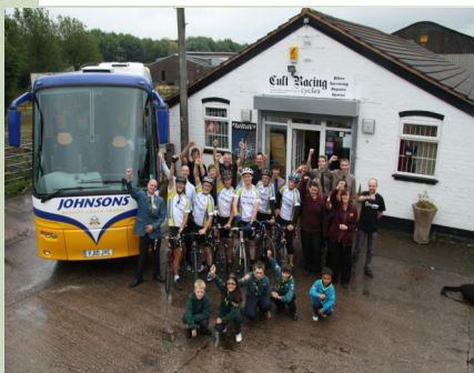
The Cycling Team along with their support staff and sponsors: Sainsbury's, Cult Cycles & Johnson Coaches