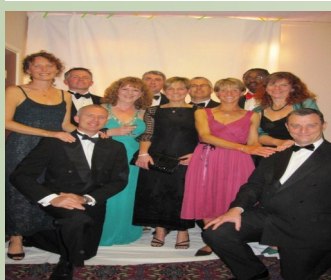
Before the wine started to flow